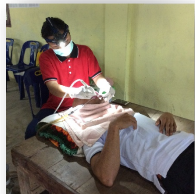
Pinta running a clinic in one of the neighbouring villages