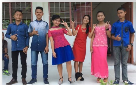
The junior high class of 2018