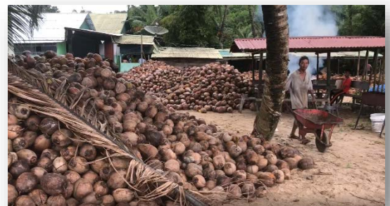
Coconuts, coconuts and more coconuts!